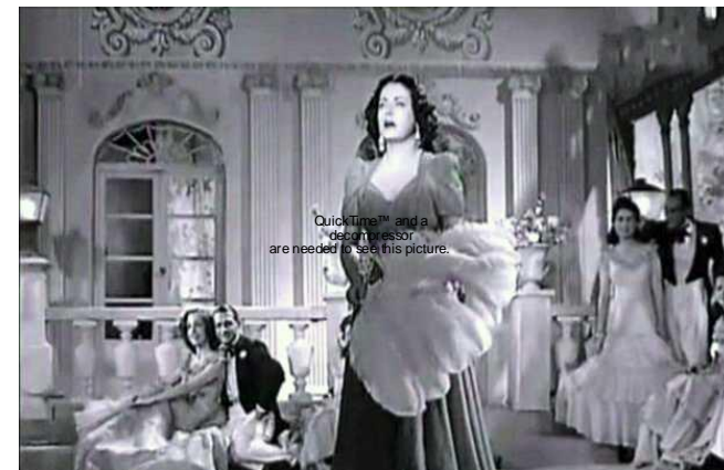
Asmahan in Gharam W' Entikam by Youssef Wahbi (1944)

In April 2000, and in the context of the national privatisation program, Elixir Artistic Services landed a 20 years lease with the right of first refusal to Studio Masr ownership and invested in an extensive renovation plan of the facility.